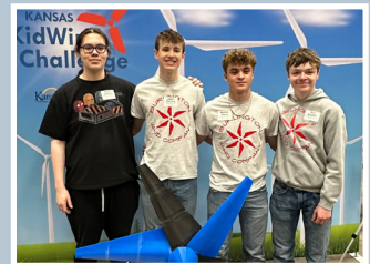
1 st place - Burlington High School Burlington Wind Company: Wind Wizards