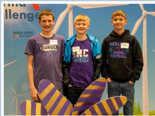
1 st place - Nemaha Central Middle School WINders