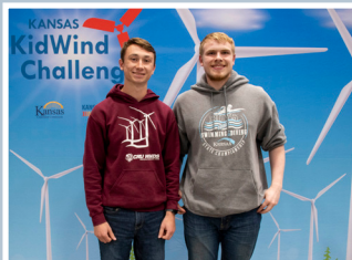
1 st place - Buhler High School Cru Winds