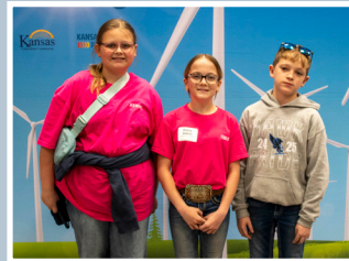
3 rd place - Grinnell Middle School Lightning Hawks