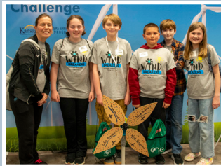
2 nd place - Sunflower Elementary Wind Breakers