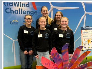
3 rd place - Beloit Jr Sr High School Girl Energy