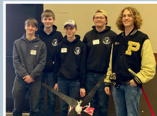
3 rd place - Paola High School D I Wires