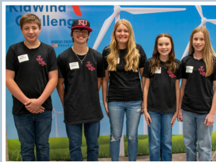
2 nd place - Oakley Middle School Wind Whisperers