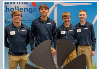
1 st place - Oakley High School The Mavericks