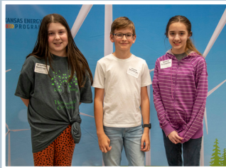
1 st place - Reno Co. Homeschool Connection RCHC Oak Leaf Engineers