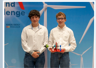
1 st place - Kepley Middle School Wind Warriors